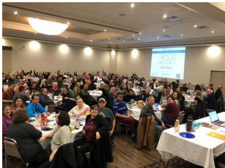
LDANR's Trivia Night Fundraiser, March 2023

Over the 2022-2023 year, the LDANR also continued to raise money from charitable gaming centres Delta Bingo Niagara Falls and Delta Bingo St. Catharines. The Ontario Charitable Gaming Association's new slogan, "Charitable Gaming. Community Good." truly captures how their funds are being put to good use by charities to do good in the community, and we are so grateful to be a recipient of these funds year after year.