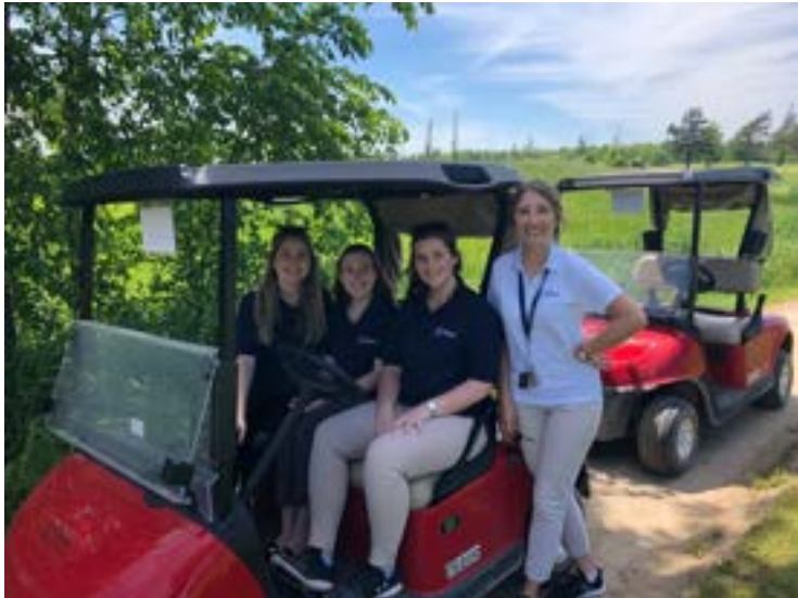
The LDANR staff doing some learning disabilities trivia at the 2019-2020 Golf Tournament Fundraiser!

sponsor year after year. We hope to continue to grow these fundraisers in the coming years, while also running smaller-scale fundraisers throughout the year. You can support the LDANR's fundraising events by participating, sponsoring, donating, or just helping to spread the word. Every little bit counts!