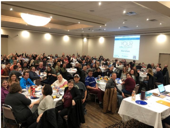
LDANR's Trivia Night Fundraiser, March 2023

Over the 2022-2023 year, the LDANR also continued to raise money from charitable gaming centres Delta Bingo Niagara Falls and Delta Bingo St. Catharines. The Ontario Charitable Gaming Association's new slogan, "Charitable Gaming. Community Good." truly captures how their funds are being put to good use by charities to do good in the community, and we are so grateful to be a recipient of these funds year after year.